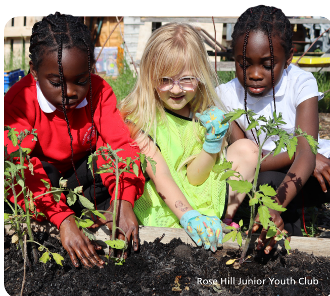
Rose Hill Junior Youth Club