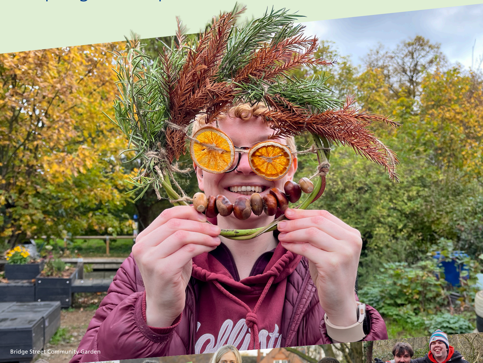
Bridge Street Community Garden