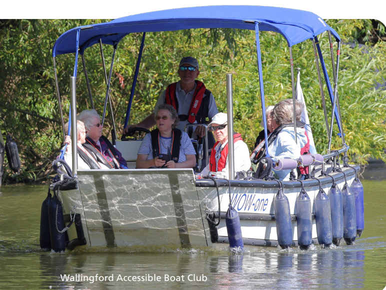
Wallingford Accessible Boat Club

During this period, the club also moved into a permanent operations facility at Riverside, Wallingford, completing an eight-year project to secure disabled-friendly access to the river. The new base provides improved boarding and access to their wheelyboat, supporting safer and more dignified experiences for passengers with a wide range of mobility needs.