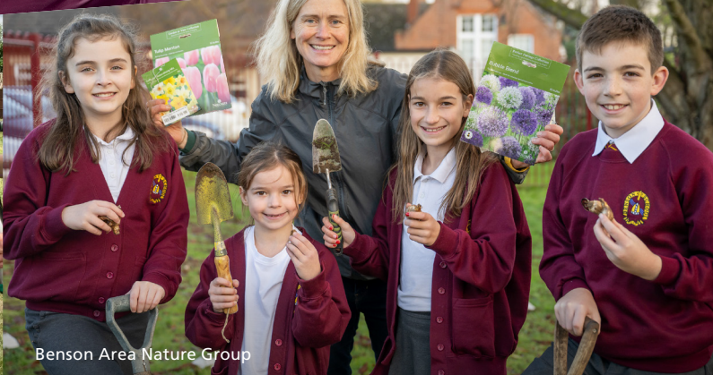
Benson Area Nature Group